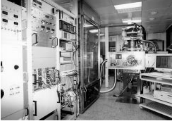
Fig. 2 rf driven volume source at DESY R&D laboratory.

A DESY designed piezo valve is now used which has successfully operated in the DESY magnetron source for many years. As the pulser of the piezo valve has to be rack mounted we had to build a new high voltage deck (see Fig. 2). The filament was replaced by a flash light which is directly mounted to the source bucket. It has a UV window Ref. [5]. The source is connected to a computer control system which delivers histograms and programmed diagrams of parameter dependencies.